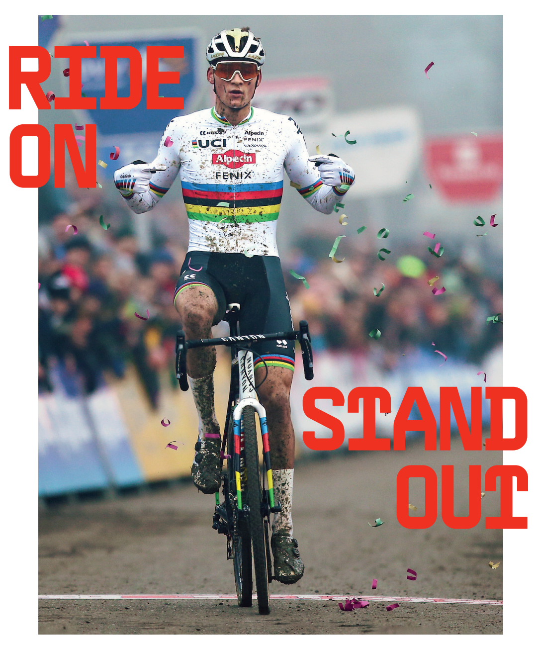
Kalas Custom. World-beating quality in your unique design.